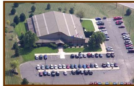
Aerial photograph of the Elkhart County, IN Department of Public Services building